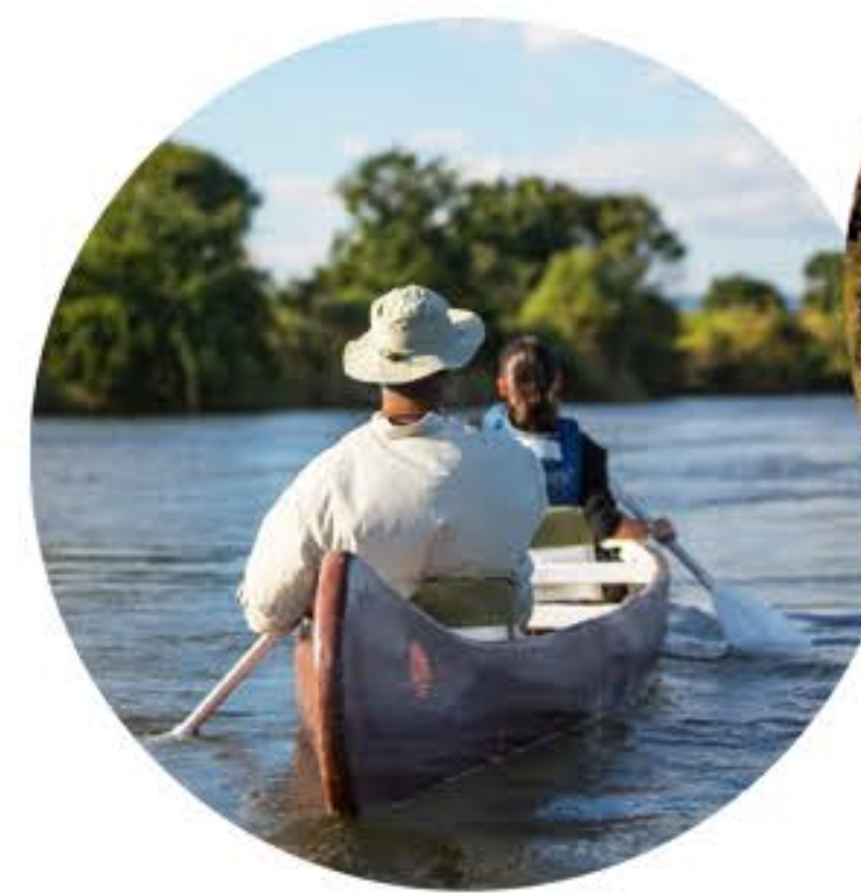
Canoeing safaris are great all year. During the driest months of August to November, wildlife congregates along the river.