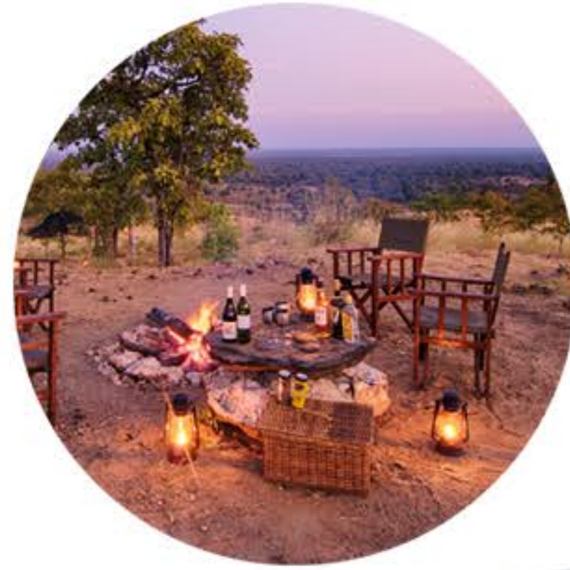
July to October is peak season for our Sleepout Under the Stars.