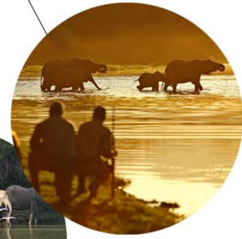
The peak walking safari season is July to October.