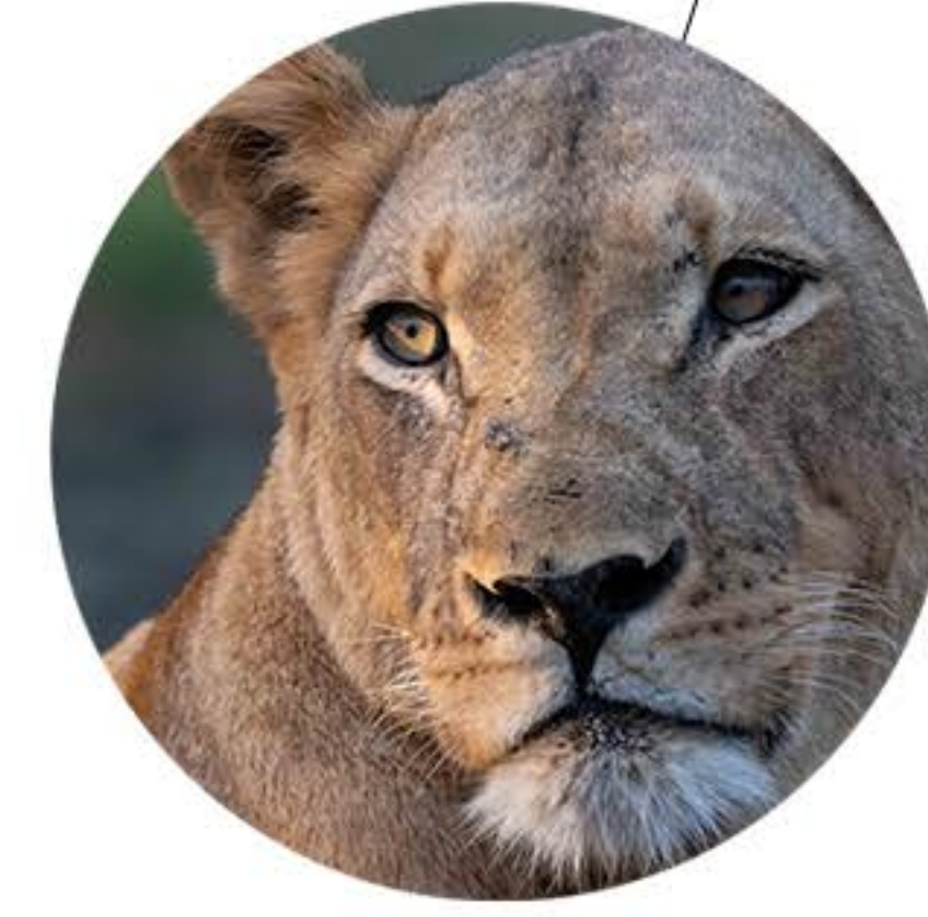
Lion and leopard sightings pick up as the bush dries out and the visibility improves.