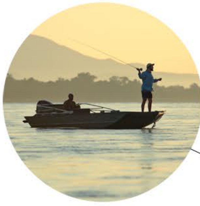
Fishing is good year round, but peaks in October and November during the breeding season.