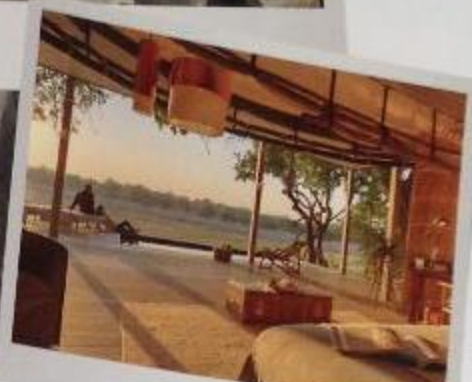
WILD BEAUTY Clockwise from left: A perpetual rainbow crowns Victoria Falls; buffalo stampede on the Busanga Plains; Chinzombo Camp; hippos wallow in the Zambezi